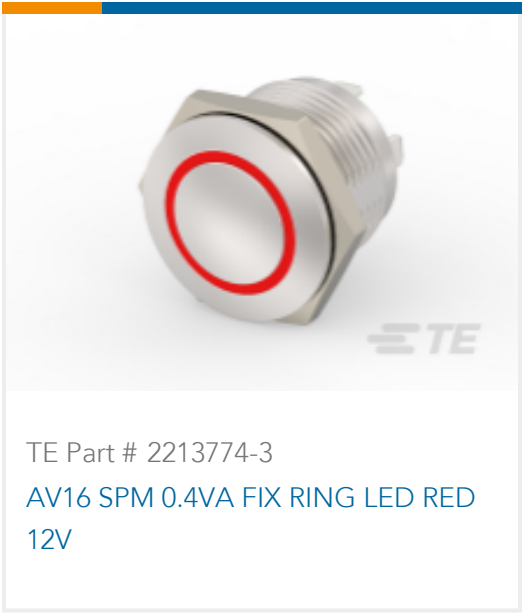
TE Part # 2213774-3 AV16 SPM 0.4VA FIX RING LED RED 12V