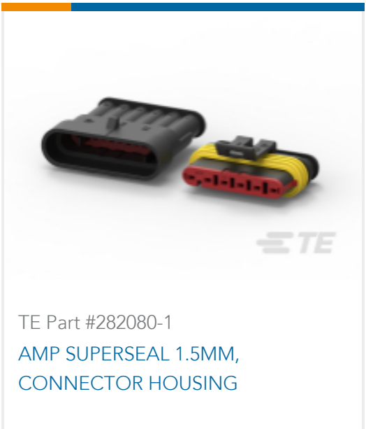
TE Part #282080-1 AMP SUPERSEAL 1.5MM, CONNECTOR HOUSING