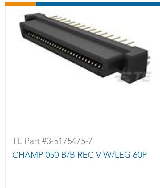
TE Part #3-5175475-7 CHAMP 050 B/B REC V W/LEG 60P