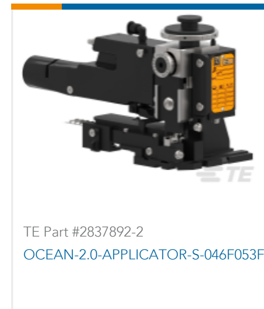
TE Part #2837892-2 OCEAN-2.0-APPLICATOR-S-046F053F