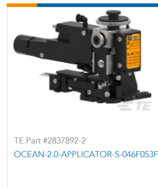
TE Part #2837892-2 OCEAN-2.0-APPLICATOR-S-046F053F