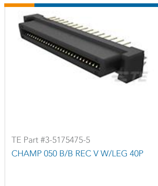
TE Part #3-5175475-5 CHAMP 050 B/B REC V W/LEG 40P