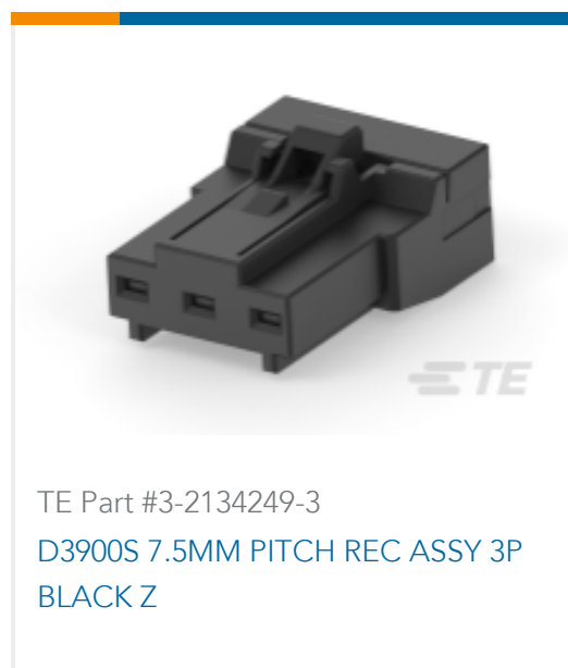
TE Part #3-2134249-3 D3900S 7.5MM PITCH REC ASSY 3P BLACK Z