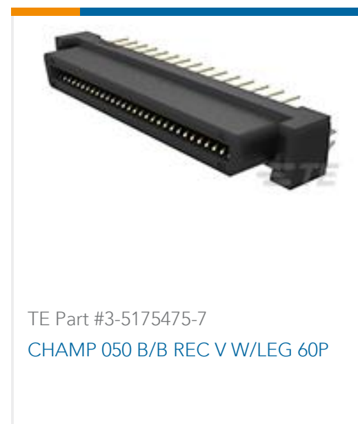
TE Part #3-5175475-7 CHAMP 050 B/B REC V W/LEG 60P