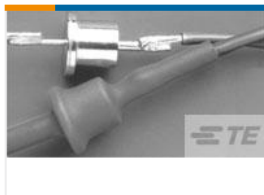
TE Part #5677924005 RNF-3000-6/2-X-SP