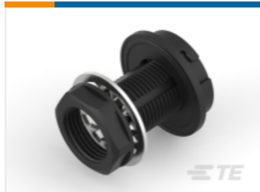
TE Part #2213858-1 RECEPTACLE ASSEM., LUMAWISE ENDURANCE S