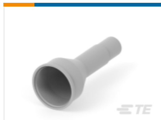
TE Part #HD10-6BT BOOT, 6P, PLG/REC, ST, GRY