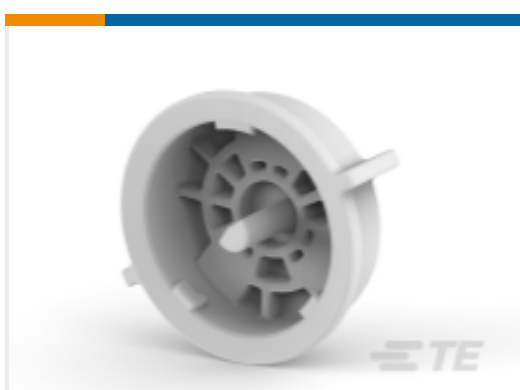
TE Part #2341474-3 SEALING CAP, RCPT, LUMAWISE ENDURANCE S