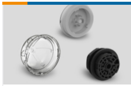
Zhaga Book 18 Street Lighting Connectors(35)