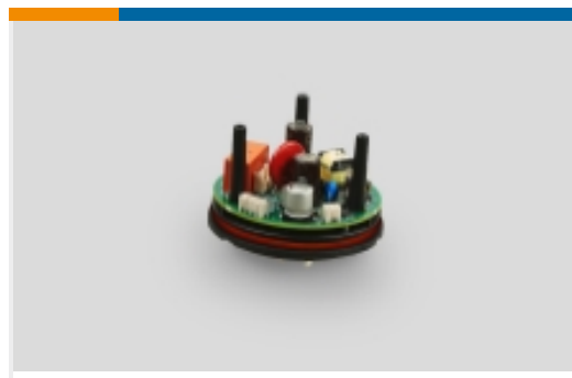
Street Lighting Power Management(1)