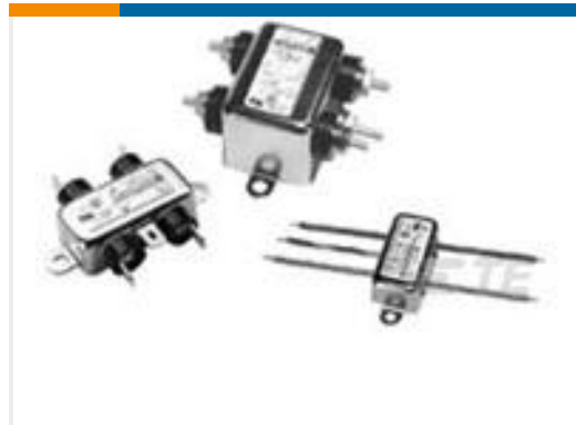
TE Part #6609021-4 2VB3=F7123 S0