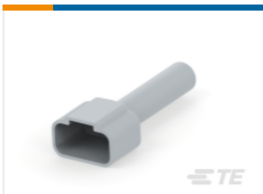
TE Part #DTM12P-BT BOOT, 12P, REC, ST, GRY