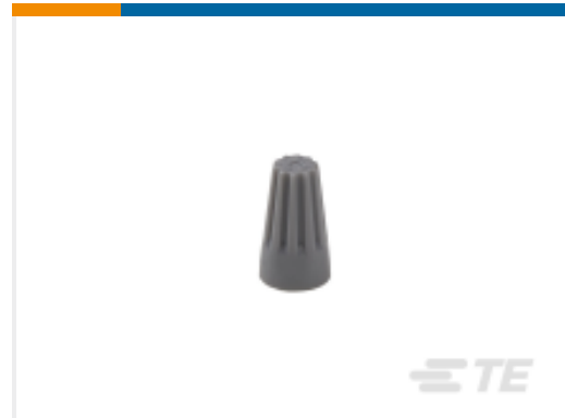
TE Part #CR2102-000 CPGI-WC-WG-GR-BULK