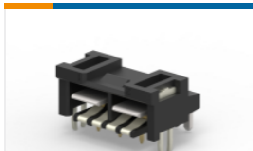
TE Part #1982295-1 ELCON MINI 2P RA HEADER, W /CODING