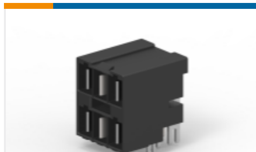
TE Part #2204535-1 ELCON MINI 2X3P STACKED RA HEADER,SOLDER