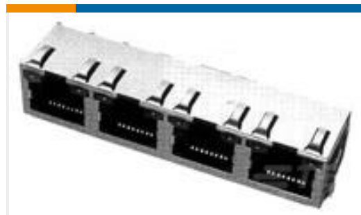
TE Part #2170359-1 INV MJ,1X4,PNL GRD