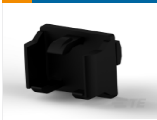
TE Part # 1761394-1 DUST COVER, SFP, GANGED & STACKED