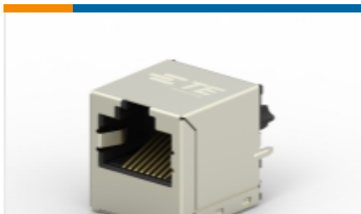
TE Part #2301995-1 RJ45 JACK INT.MAG. 1GB 1X1 VERT.