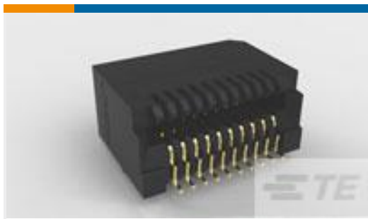
TE Part #1888247-1 20 POS SMT CONN, SFP/SFP+, 30A