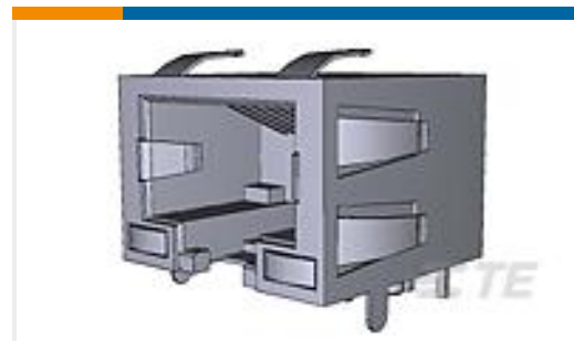
TE Part #6-1734324-7 RJ45 w/ Y/GO LED PAL GND T&R 30u"