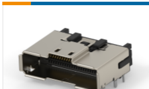
TE Part #2292055-1 RECEPTACLE ASSY RA 50 POSN MBC