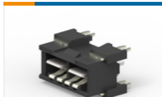
TE Part #2042274-1 ELCON MINI 2P VERT HEADER,W/ CODING