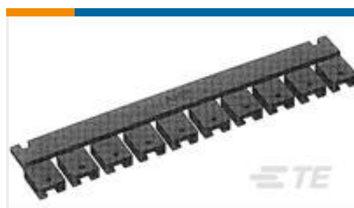
TE Part #531230-4 SHUNT,.200 C/L, 2 POS, SN