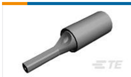
TE Part #165049 TERM, WIRE PIN, PIDG, 12 - 10, -ASI