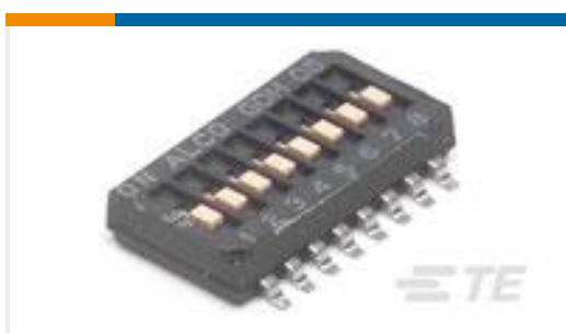
TE Part #1571983-5 GDH04STR04=DIP SWITCH