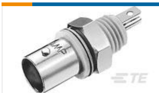
TE Part #5227726-2 ISOLATED BNC SOLDER JACK ASSY