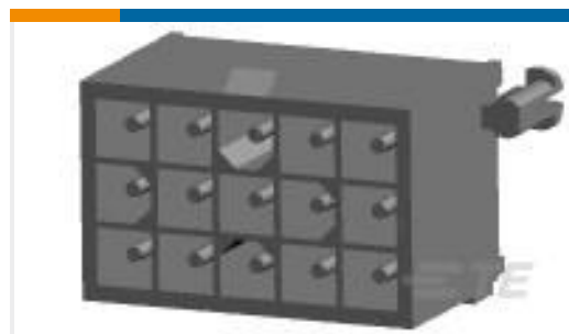
TE Part #1-770190-1 15P MINI UMNL ASSY VO SNAU LF