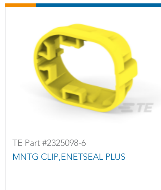
TE Part #2325098-6 MNTG CLIP,ENETSEAL PLUS