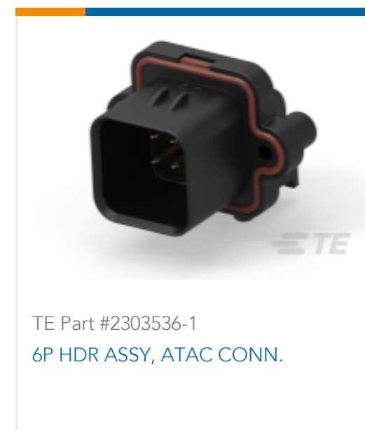
TE Part #2303536-1 6P HDR ASSY, ATAC CONN.