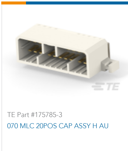
TE Part #175785-3 070 MLC 20POS CAP ASSY H AU