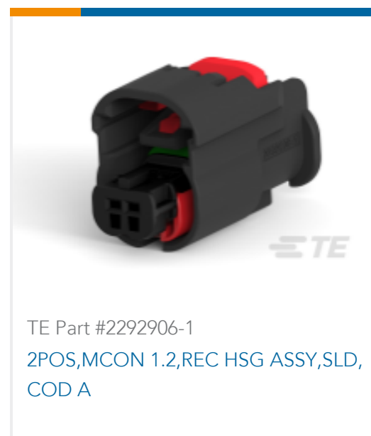
TE Part #2292906-1 2POS,MCON 1.2,REC HSG ASSY,SLD, COD A