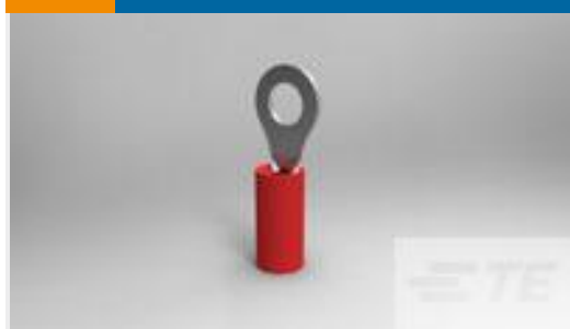
TE Part #31886 PIDG R 22-16 COMM 22-18 MIL 8