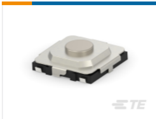
TE Part #2337243-1 TACT MINI JB 5.2X5.2X1.5 70GF