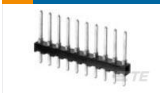
TE Part #87221-5 06 MODII HDR SRST UNSHRD .150