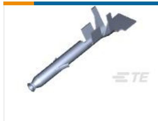
TE Part #770904-1 MINI UMNL SOK 22-18 AWG SN