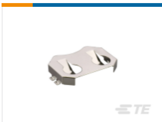
TE Part #BAT-HLD-001 Battery Holder Coin 2032 SMT Nickel Bulk