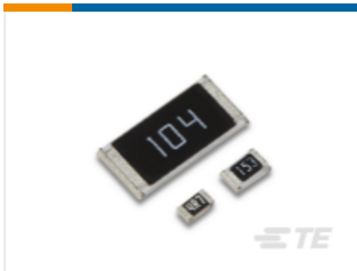
TE Part #5-2176337-1 CRGCQ 0402 150K 1%