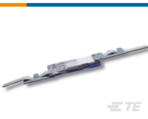
TE Part #A22899-000 CPGI-1116377-2