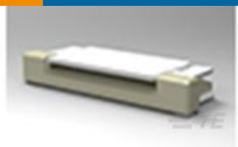
TE Part #3-1734839-0 FPC CONN. 0.5MM PITCH T/C,30P