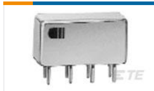
TE Part #1-1617036-2 HFW4A1201K00 = 2100 HFW 4A REL