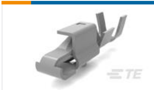
TE Part #3-770522-1 SL156 HOODED CONTACT, LP LF