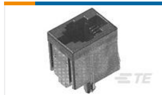
TE Part #216550-1 8/8 PCB MOD.JACK TE