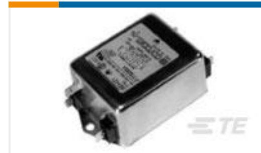
TE Part #3-1609037-3 30EHZ6=F8358