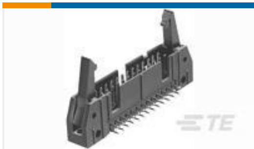
TE Part #5499141-7 A/L UNIV HDR 30P RA LG LAT