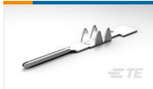
TE Part #88976-4 CONTACT,PIN,TIN PLATE,FFC