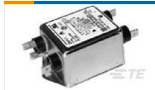
TE Part #6609056-4 20MV1=F7759 S0