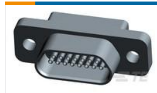
TE Part #1532188-1 M83513/02-BN, MCKS-N1-B-15SS