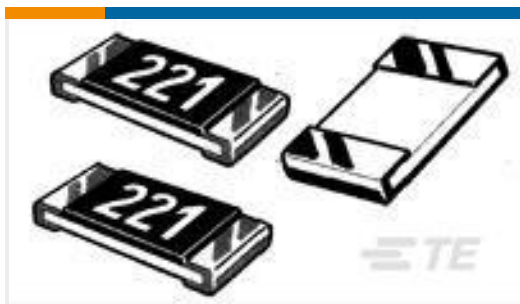
TE Part #2176070-3 3521 12R 1% 2W