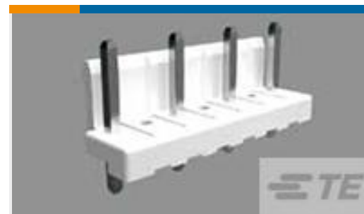
TE Part #1-1123724-2 3.96EP HDR ASSY 2(3)P NATURAL