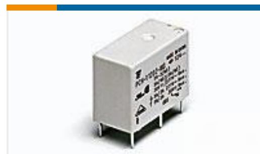
TE Part #1721768-2 PCH-105L2M-WG