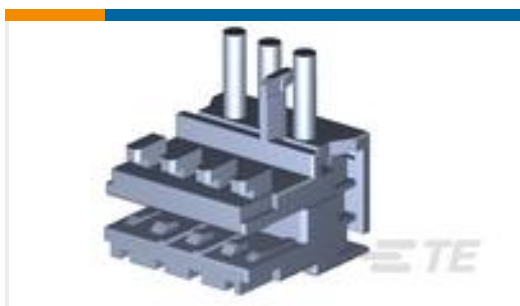
TE Part #1-1740501-3 AMP DUOPLUG2.5 MK II HOUSING W. PCB LOCK