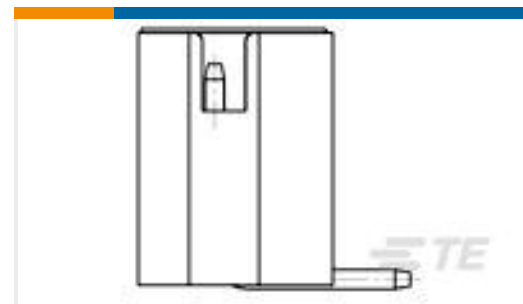
TE Part #1775470-2 HPI CONN., 2.0MM, V/T, SMT, 2P, 80U"