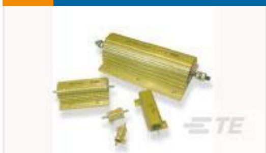
TE Part #4-1625966-3 HSA10 68R 5%