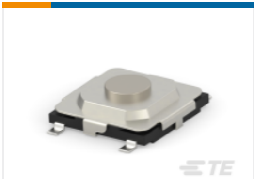
TE Part #2337237-4 TACT MINI GW 5.2X5.2X1.5 260GF