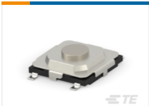
TE Part #2337237-1 TACT MINI GW 5.2X5.2X1.5 70GF