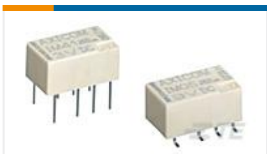
TE Part #1-1462037-4 IM03GR=IM RELAY 140mW 5V