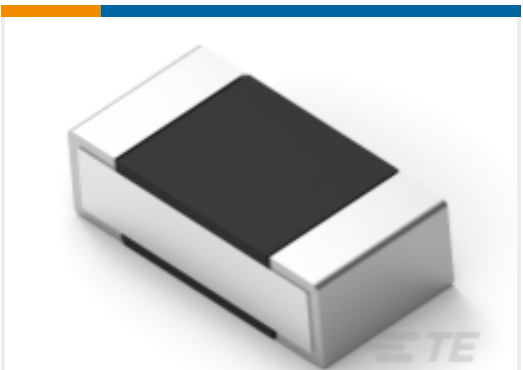
TE Part #7-2176306-1 RP 1E 0.1W 6K19 0.1% 25PPM 5K RL