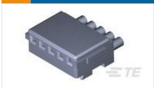
TE Part #2058943-4 Cable Assembly Mini CT 5 pos.