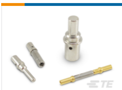
TE Part #0462-201-16141 DEUTSCH Solid Contacts