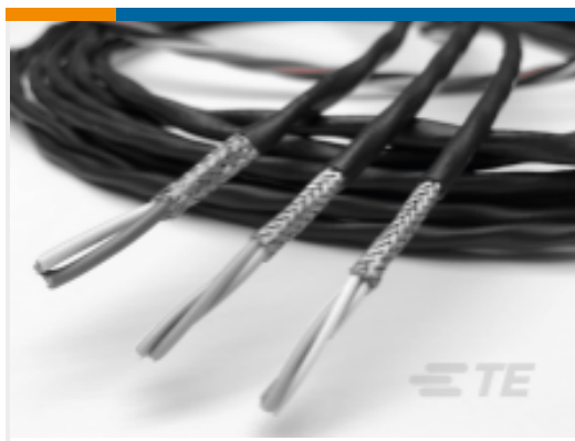
TE Part # CAT-R2137-Z612G RL1141 Four Core Cable