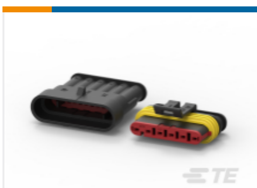
TE Part #282080-1 AMP SUPERSEAL 1.5MM, CONNECTOR HOUSING