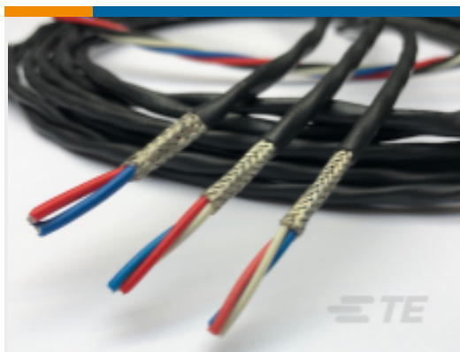
TE Part #2336372-2 RL1121-1.50-9/9-0