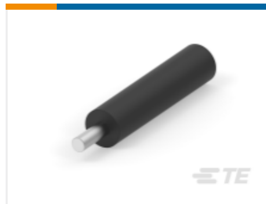
TE Part # 2361830-1 RL1121-1.00-2/6-0