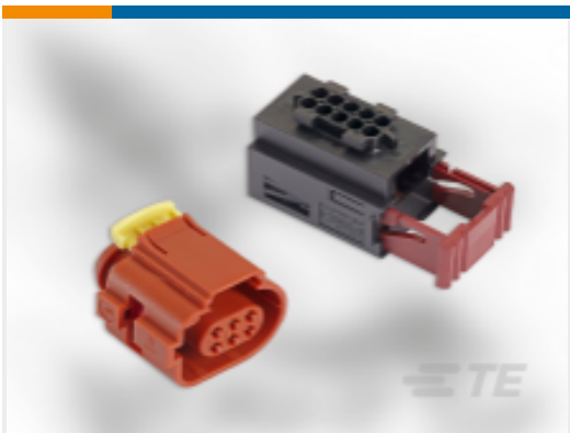
TE Part #1-967625-4 Timer Connector Housing