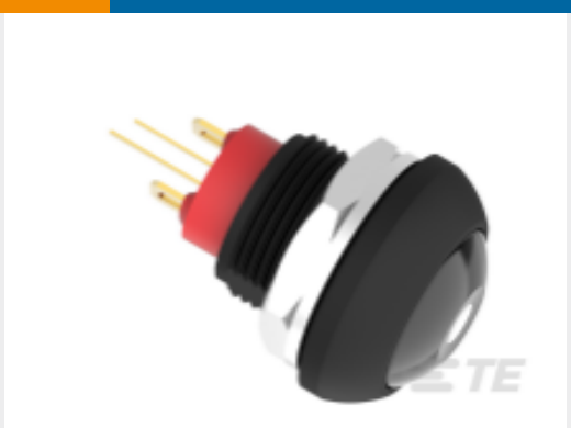
TE Part #2329387-1 PB OFF/ON FC BLK M1 TERM WHI LED IP68