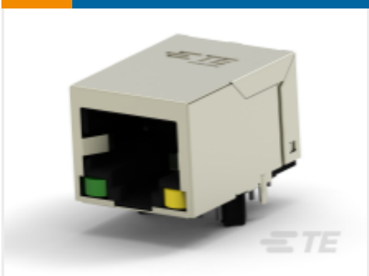
TE Part #2337992-8 RJ45 JACK MAG. POE 1GB LED 1X1