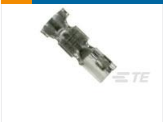
TE Part #179518-1 CT CRIMP-2 REC CONT. L/P