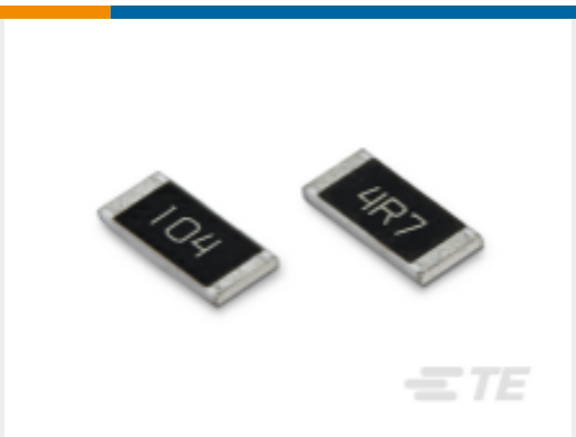
TE Part #5-2176455-5 CPF 0402 402K 0.1% 25ppm 1K RL