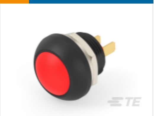
TE Part #2329360-7 PB OFF/ON RC RED M2 TERM. IP68