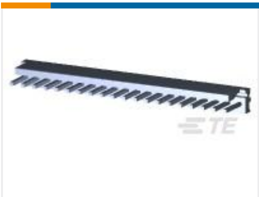
TE Part #2-640445-0 20P MTA156 HDR ASSY FL/STR SN