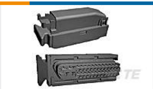
TE Part #1393450-3 V23542C1052B102=52P KABELBAUM-