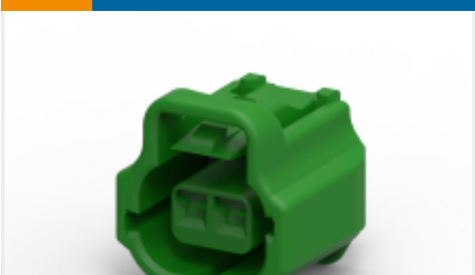
TE Part #2822362-4 070 EJ MK-2 SENSOR PLUG 2P DARK GREEN