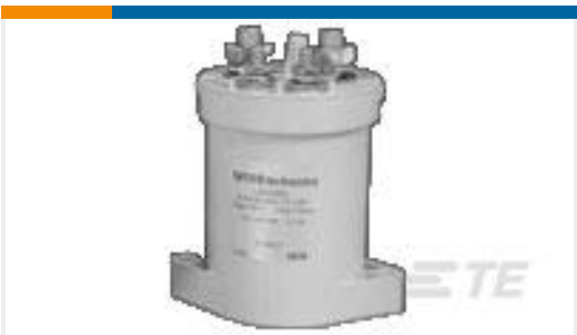
TE Part #1618387-3 LEV200A4ANA=RELAY, SPST-NO