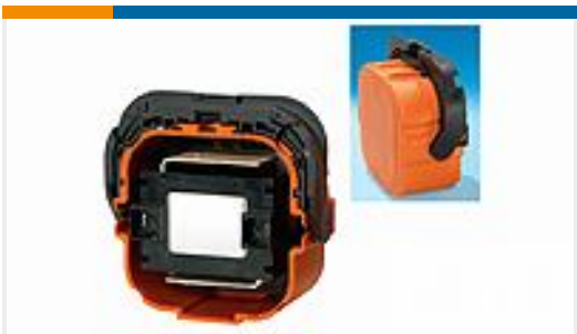
TE Part #2103172-9 Plug Assembly, 250A, MSD