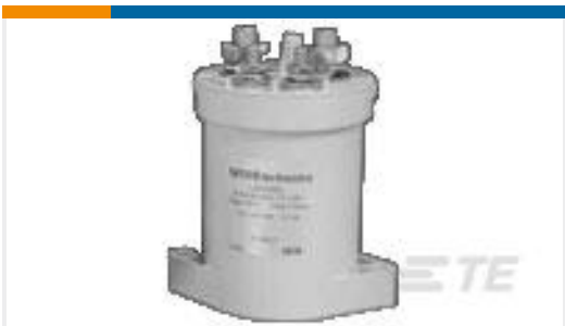
TE Part #1618387-7 LEV200A4NAA=RELAY, SPST-NO