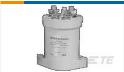
TE Part #3-1618389-7 LEV100A4ANG=RELAY, 12Vdc SPST-NO