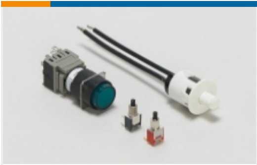
Push Button Switches(30)