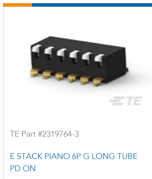
TE Part #2319764-3 E STACK PIANO 6P G LONG TUBE PD ON