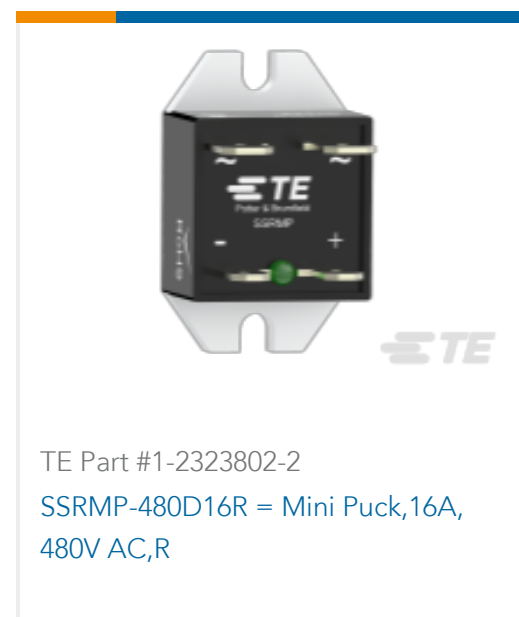
TE Part #1-2323802-2 SSRMP-480D16R = Mini Puck, 16A, 480V AC, R