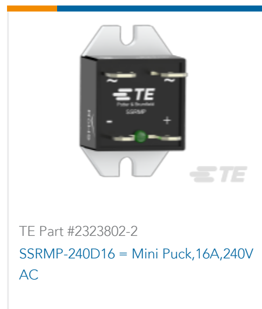
TE Part #2323802-2 SSRMP-240D16 = Mini Puck, 16A, 240V AC