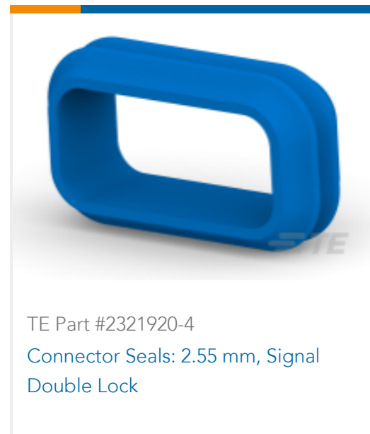
TE Part #2321920-4 Connector Seals: 2.55 mm, Signal Double Lock