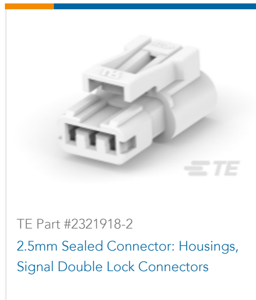
TE Part #2321918-2 2.5mm Sealed Connector: Housings, Signal Double Lock Connectors