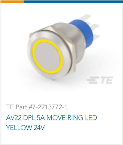
TE Part #7-2213772-1 AV22 DPL 5A MOVE RING LED YELLOW 24V