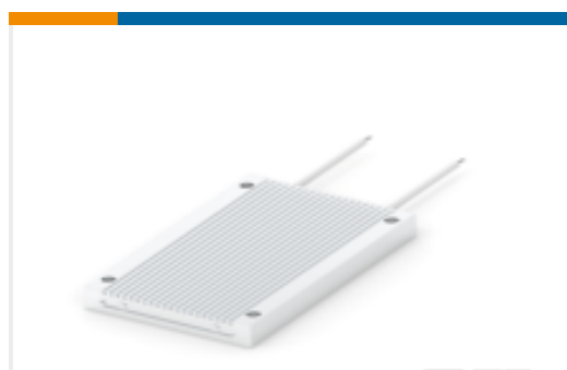
TE Part #2176247-1 TJT 150W 1R0 5%