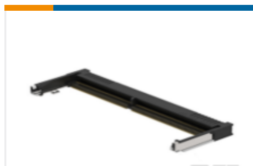
TE Part #2309407-2 DDR4 SO DIMM Sockets