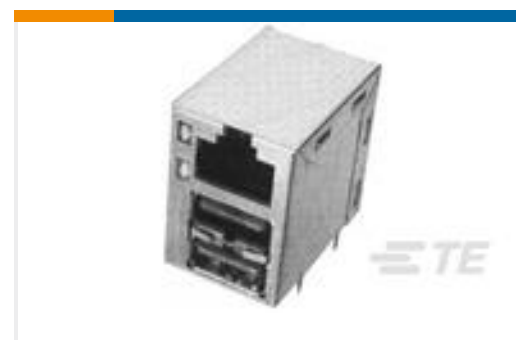
TE Part #1888371-1 MJ,2X1RJ45+2USB,BLACK,NOLEDS