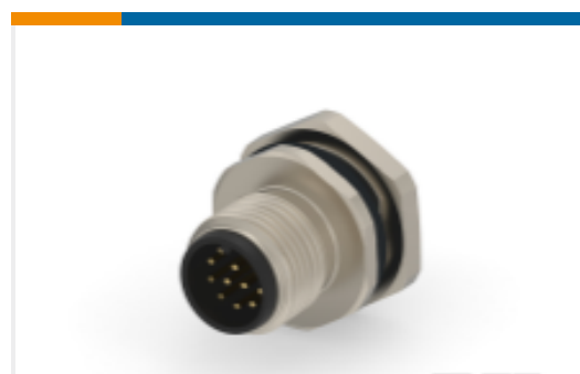
TE Part #T4171230012-001 M12,FRONT MOUNT,MALE, A,12P, 0.2 M WIRE