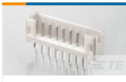
TE Part #440054-7 2.0MM,HDR,7POS,VERTICAL