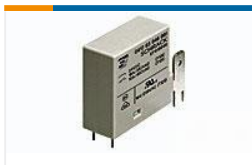
TE Part #9-1415535-3 0410 63 050 005WG