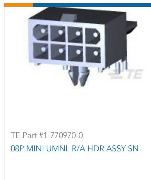
TE Part #1-770970-0 08P MINI UMNL R/A HDR ASSY SN