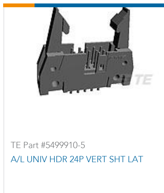
TE Part #5499910-5 A/L UNIV HDR 24P VERT SHT LAT