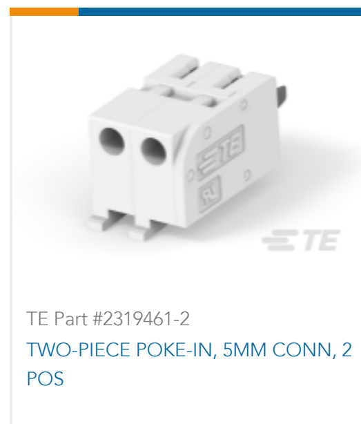
TE Part #2319461-2 TWO-PIECE POKE-IN, 5MM CONN, 2 POS