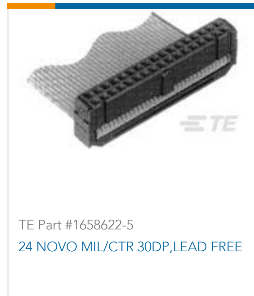
TE Part #1658622-5 24 NOVO MIL/CTR 30DP, LEAD FREE