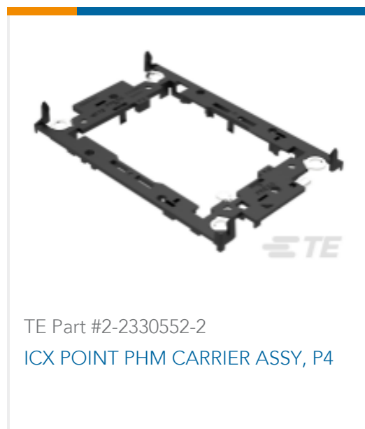
TE Part #2-2330552-2 ICX POINT PHM CARRIER ASSY, P4