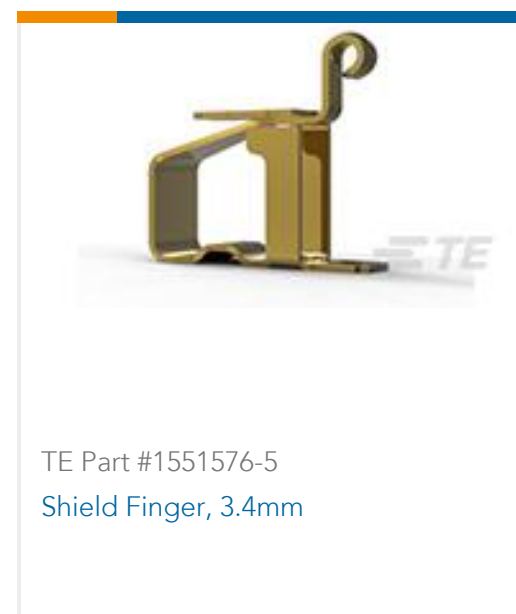
TE Part #1551576-5 Shield Finger, 3.4mm