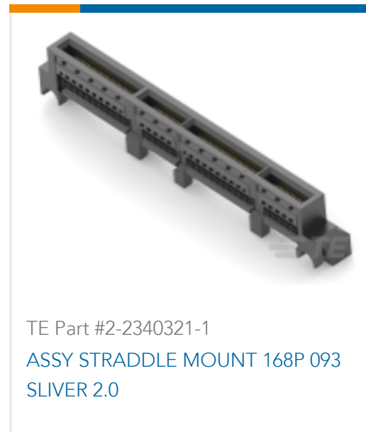
TE Part #2-2340321-1 ASSY STRADDLE MOUNT 168P 093 SLIVER 2.0