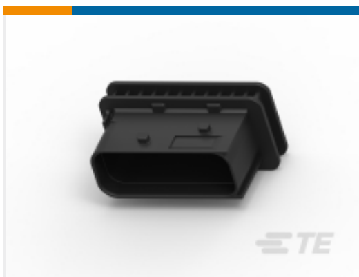
TE Part #2112303-1 PROTECTION CAP, FOR REC.HSG GROUP E