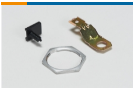
Other Automotive Connector Accessories(11)