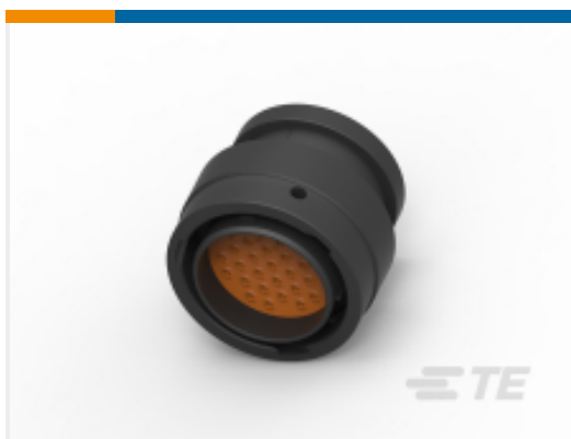
TE Part #HDP26-24-31PE-L017 PLG, 31P, BLK, E, RNG, 16, P