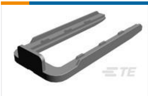
TE Part #1718328-1 FIXING SLIDE