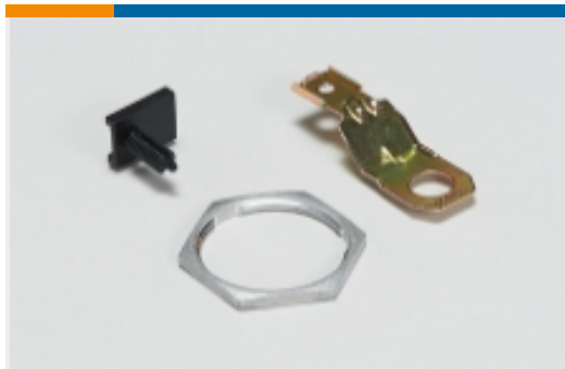
Other Automotive Connector Accessories(11)