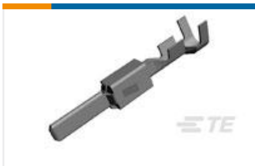
TE Part #2-962916-1 TAB 2.8x0.8 CONTACT CF SWS Sn