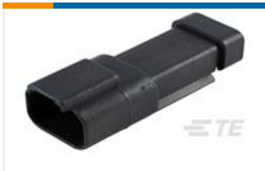
TE Part #DT04-2P-E005 REC, 2P, BLK, N, CAP