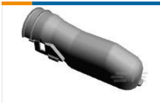
TE Part #1418882-1 COVER FOR 62POS.REC.HSG