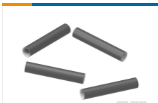
TE Part #926845P006 FL2500 Heat shrink Tubing