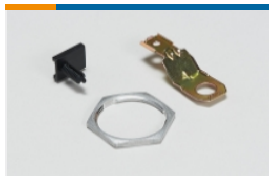
Other Automotive Connector Accessories(11)