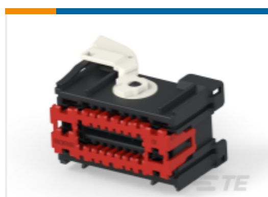
TE Part #2138731-2 36P UNSEALED HYBRID PLUG ASSEM