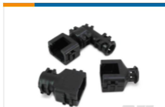
TE Part #2035366-1 AMPSEAL 16 Connectors Backshell