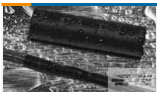
TE Part #121397P023 ES2000-NO.3-B8-0-27MM