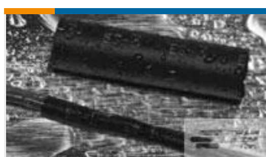
TE Part #EG9829-000 ES2000-NO.2-B9-0-127MM