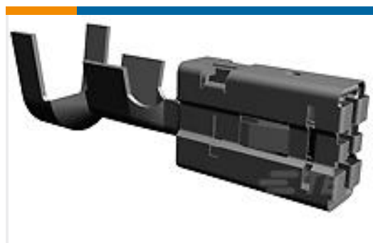
TE Part #1-967590-1 AMP MCP 9.5, CONTACT, SWS