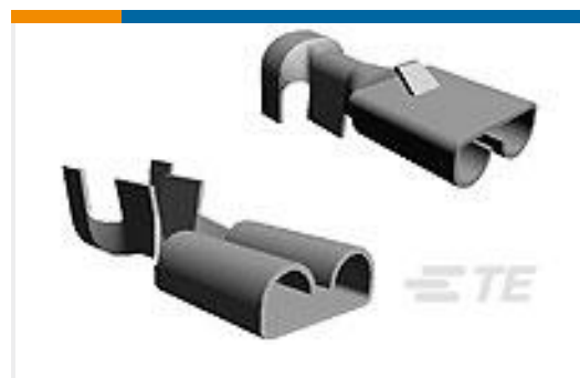
TE Part #60253-2 FF 250 REC 16-12AWG TPBR