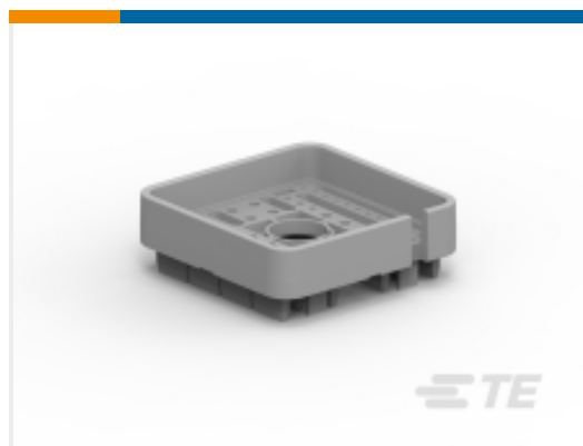
TE Part #WB-64SA DEUTSCH DRB Wedgelocks