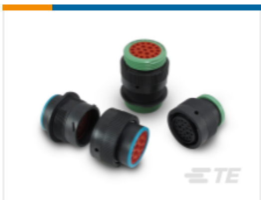
TE Part #YHDP26-24-23SEL024 DEUTSCH HDP20 Housings