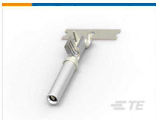
TE Part #2098253-2 SOC, SF, SIZE 16, 14-16 AWG, NI/SN