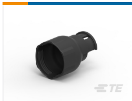
TE Part #2428-025-1805 BKSHL, 18SZ, BLK, ST, L024, HDP