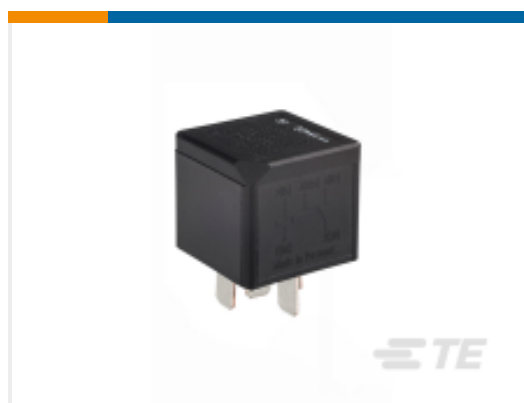
TE Part #1-1414687-0 V23136A0004X059-EV-CBOX