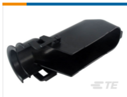
TE Part #2138853-1 WIRE EXIT COVER, AMPSEAL 16 HL