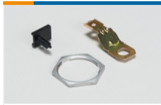
Other Automotive Connector Accessories(11)