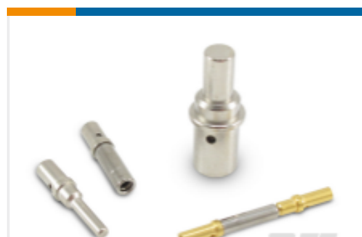
TE Part #0462-201-16141 DEUTSCH Solid Contacts