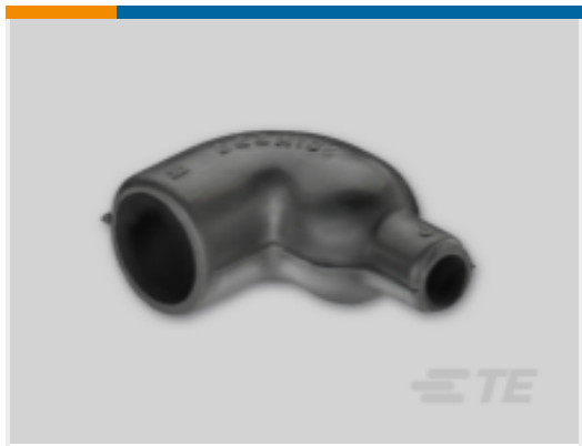
TE Part #369242-000 Bulbous Heat Shrink Boots: Lipped, Right Angle