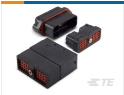
TE Part #DRC12-70PAE DEUTSCH DRC Housings