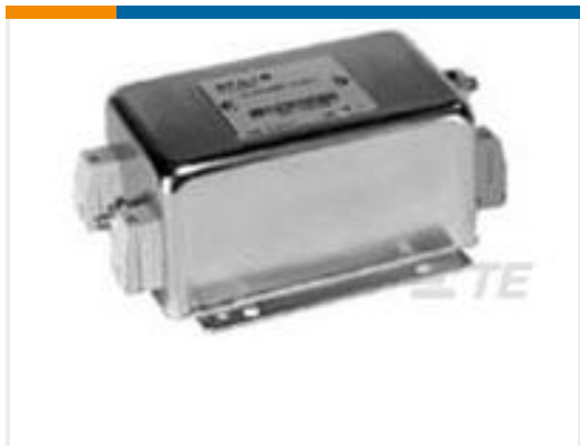
TE Part #6609069-5 36FC10 D0=F7752