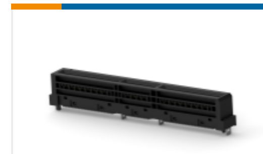
TE Part #2327677-3 RECEPT ASSY, 140 POS, VERT, SLIVER 2.0