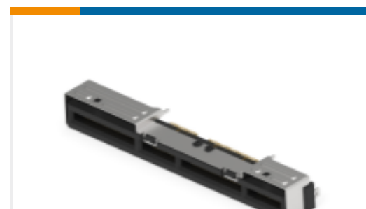
TE Part #2384218-3 SLIVER 2.0 4C+ vertical receptacle