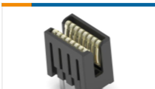
TE Part #2344604-1 50 AMP CARD EDGE ASSEMBLY