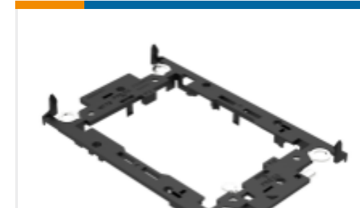
TE Part #2-2330552-2 ICX POINT PHM CARRIER ASSY, P4