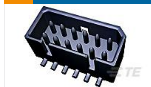
TE Part #4-176891-4 1.25FP,P14,DL,O,N,TR,5.00,6.90