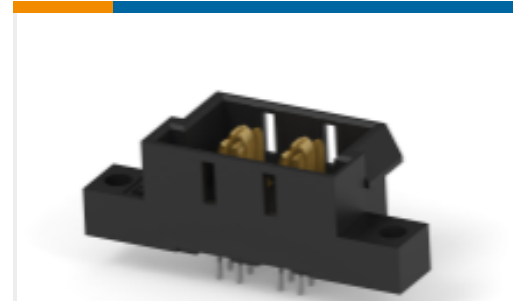
TE Part #1-6450824-8 MBXL VERT HDR STR 2ACP