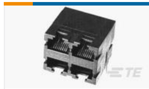
TE Part #5569260-1 STK MJ ASSY,8POS,2X2,SHLD,CAT5