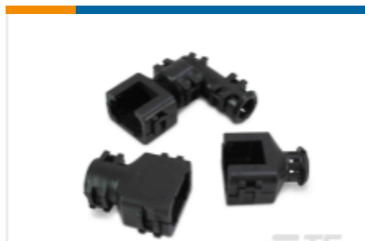
TE Part #2292863-3 AMPSEAL 16 Connectors Backshell