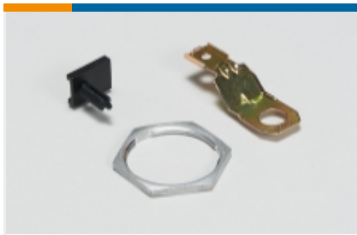
Other Automotive Connector Accessories(11)