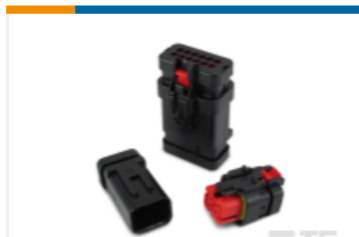
TE Part #2040594-5 AMPSEAL 16 Housings