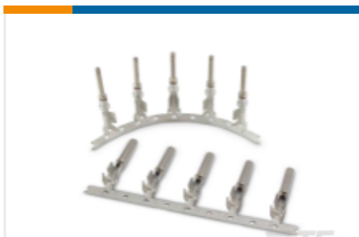
TE Part #2098251-1 Contacts: Size 16, 13A