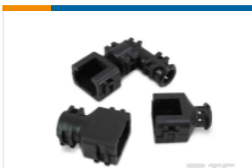
TE Part #2292799-2 AMPSEAL 16 Connectors Backshell