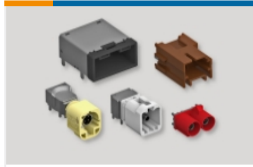
Data Connectivity Headers (2)