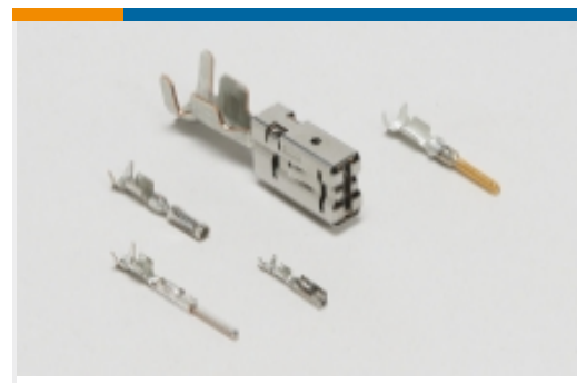
Automotive Terminals (33)