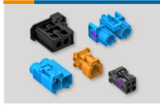
Data Connectivity Housings (3)