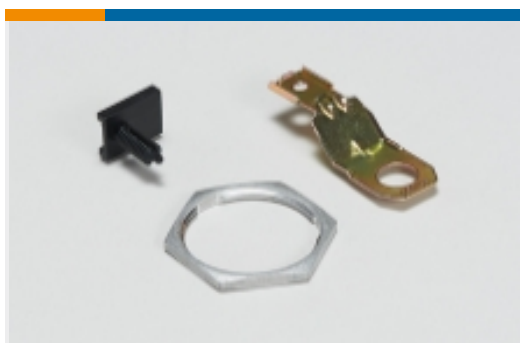
Other Automotive Connector Accessories(11)