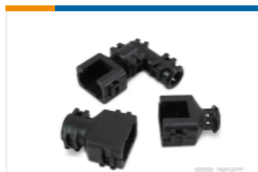
TE Part #2292798-2 AMPSEAL 16 Connectors Backshell