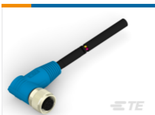
TE Part #T4161410008-002 RPC-M12-FR-8CON-PVC-1.0SH