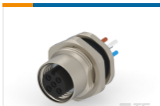
TE Part #T4171110005-001 M12,REAR MOUNTING,FEMALE,A,5P, 0.2M WIRE