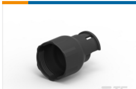
TE Part #2428-025-1805 BKSHL, 18SZ, BLK, ST, L024, HDP