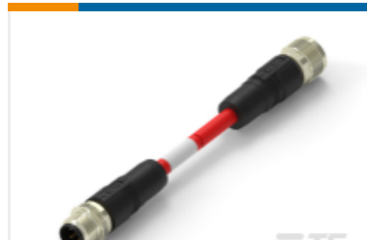
TE Part #TAA545B1411-002 M12A4-MS-FS-PVC-1.0M