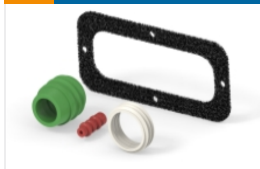
Connector Seals & Cavity Plugs(4)