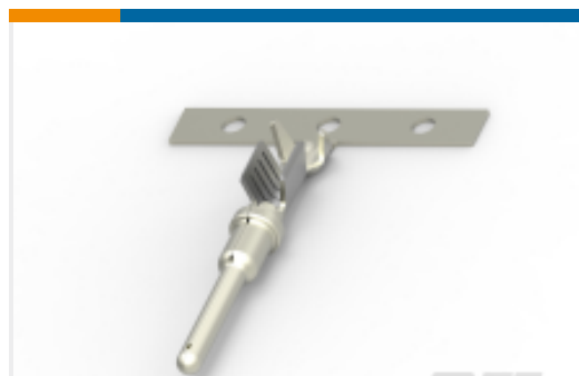
TE Part #2098250-3 PIN, SF, SIZE 16, 16-18 AWG, NI/SN