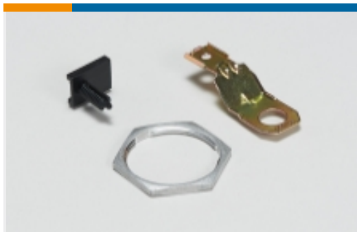
Other Automotive Connector Accessories(11)