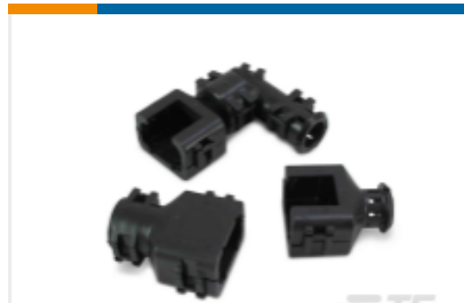
TE Part #2292865-2 AMPSEAL 16 Connectors Backshell