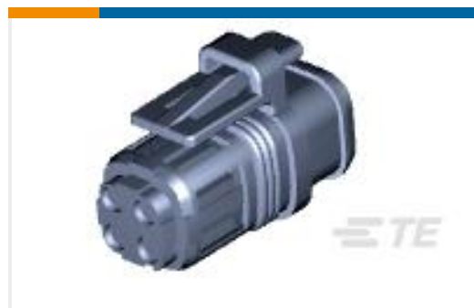
TE Part #1337352-1 E3 RECEPTACLE CONN. ASSY.