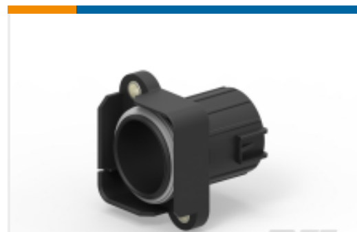
TE Part #2-1670816-1 1POS,RING TONGUE,HOUSING,ASSY.