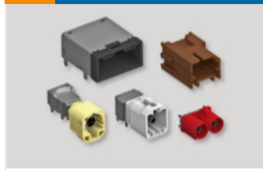
Data Connectivity Headers(2)