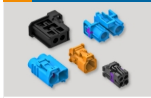
Data Connectivity Housings(3)