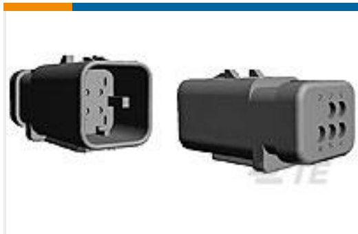
TE Part #776538-3 AS 16, 8P CAP ASSY, RD, KEY 3