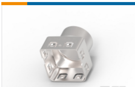
TE Part #9-2141158-2 CU ALLOY,SHIELD,8MM HV,CONN HSG,90 DEG