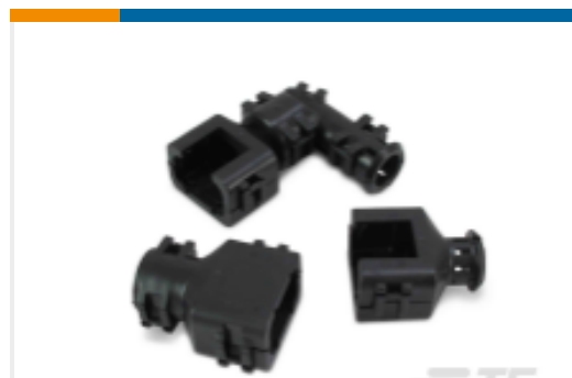
TE Part #2292797-1 AMPSEAL 16 Connectors Backshell