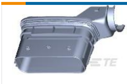
TE Part #2-1718324-1 1.5/2.8MM TAB HSG.,62POS.,SEALED