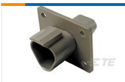
TE Part #DT04-3P-L012 REC, 3P, GRY, N, FLANGE