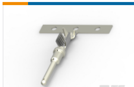
TE Part #2098250-3 PIN, SF, SIZE 16, 16-18 AWG, NI/SN