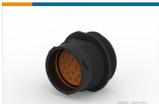
TE Part #YHDP24-24-29PEL024 REC, 29P, BLK, E, WTHD, 12/16/20, P MC