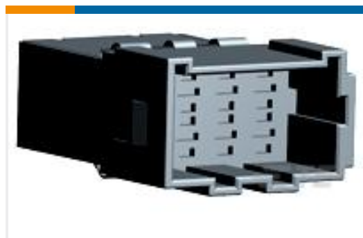
TE Part #969191-2 FLA-STE-GEH2,8 8P