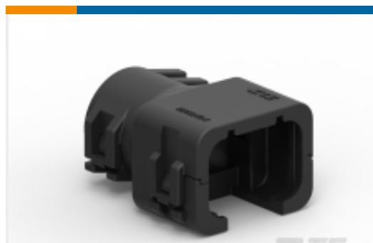
TE Part #2292799-3 AS16 BACKSHELL, 4P PLUG, NC12, MC