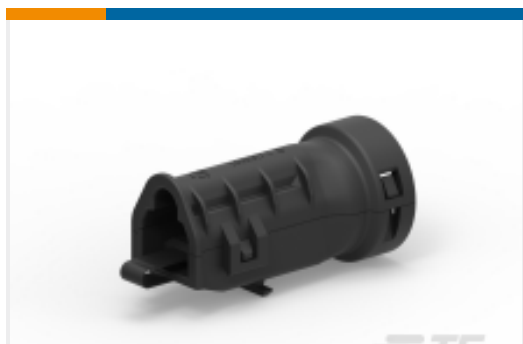
TE Part #1418917-1 MULTI CORE CABLE ADAPTER 180 DEGREE