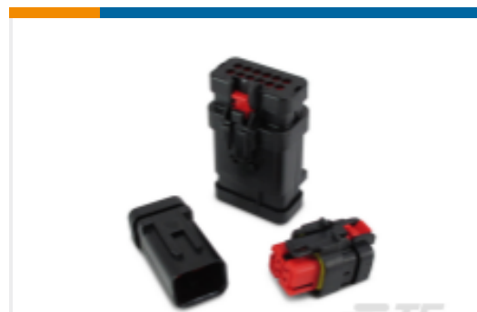
TE Part #776532-2 AMPSEAL 16 Housings