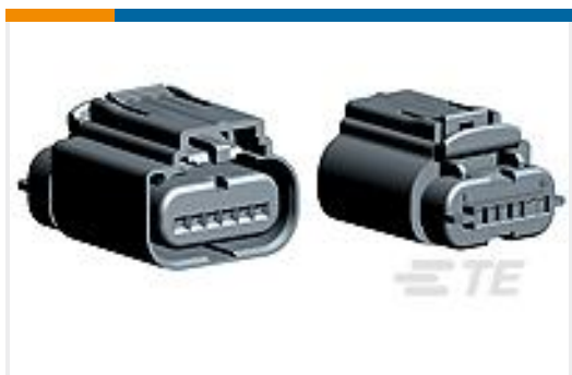
TE Part #1-1419168-2 MARKET 1X6 FEMALE SEALED