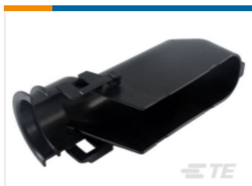
TE Part #2138853-1 WIRE EXIT COVER, AMPSEAL 16 HL