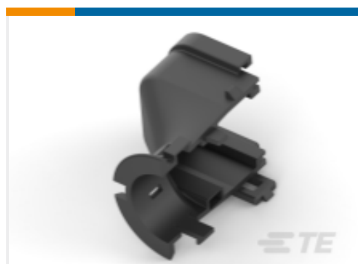
TE Part #2203956-1 COVER,AMPSEAL 16 ML CONN, 180 DEG