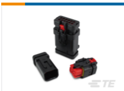
TE Part #776434-2 AMPSEAL 16 Housings