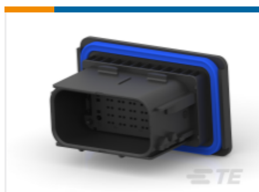
TE Part #2272889-4 24POS, AMPSEAL 16, PIN HSG ASSY, SLD, COD D