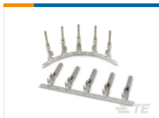
TE Part #776299-2 Contacts: Size 16, 13A