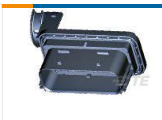
TE Part #2138846-1 CAP ASSY, 28 POS, KEY A, AMPSEAL 16 HL