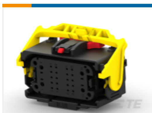
TE Part #2203859-4 24POS, HYBRID, SOC HSG ASSY, SLD, COD D