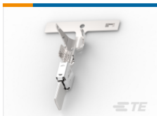
TE Part #2-2112966-2 TAB 5.8x0.8 CONTACT CF SWS Ag