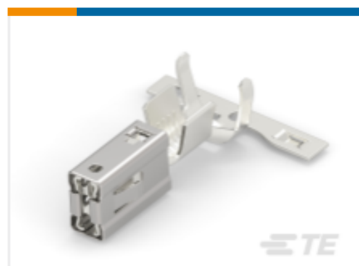
TE Part #1-1241418-3 AMP MCP 6.3/4.8K, CONTACT, SWS