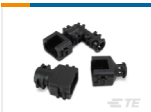
TE Part #2292797-3 AMPSEAL 16 Connectors Backshell