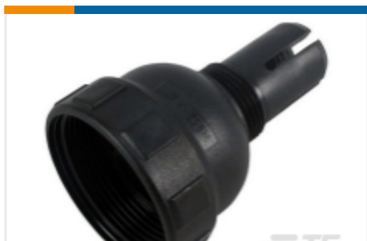
TE Part #M902-2191 BKSHL, 9SZ, CBL SZ .187-.300, HD10