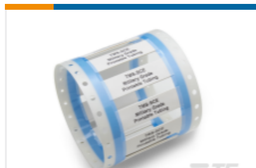
TE Part #4575670001 TMS-SCE Military Grade Sleeves