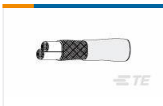
TE Part #3820013001 44A1121-20-9/9-9