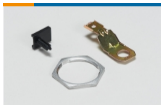
Other Automotive Connector Accessories(11)