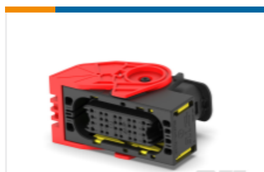
TE Part #SRK06-MDF-32A-001 PLG, 32P, BLK, E, F