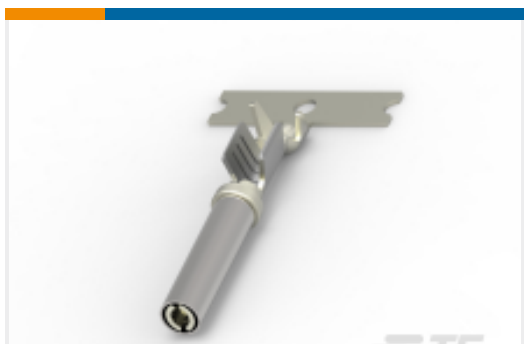
TE Part #2098251-2 SOC, SF, SIZE 16, 16-18 AWG, NI/SN