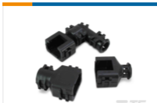
TE Part #2292860-1 AMPSEAL 16 Connectors Backshell