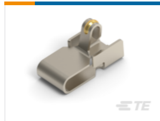
TE Part # 2199249-3 Shield Finger, Loose Piece, Type B, 2.0 h