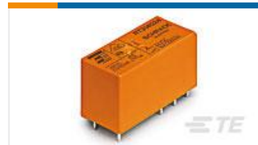
TE Part #1-1419108-1 RT315730