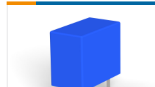
TE Part #1721261-5 OJE-SS-112LMH2