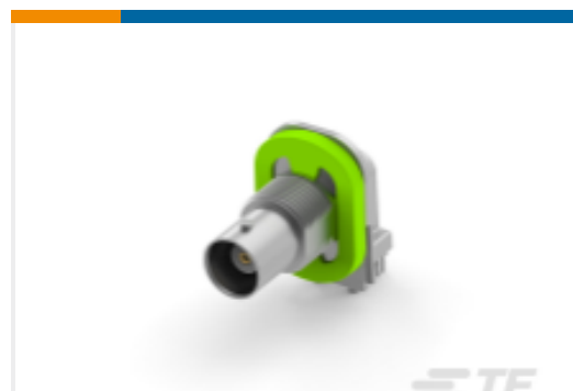
TE Part #2016166-1 JACK, R/A PCB, 50 OHM, BNC