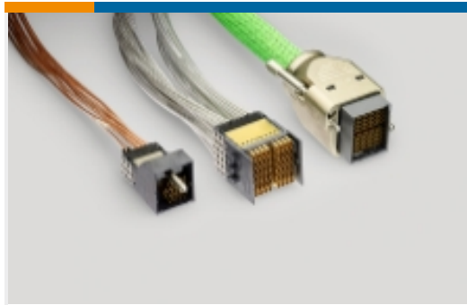
High Speed Backplane Cable Assemblies(16)