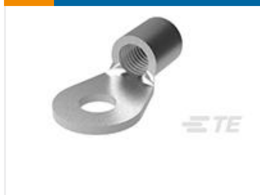
TE Part #2-322796-1 STRATO R 22-16COMM 22-18MIL 4