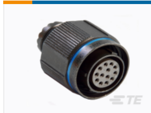
TE Part #YDTS26G17-35SNV001 PLUG ASSY