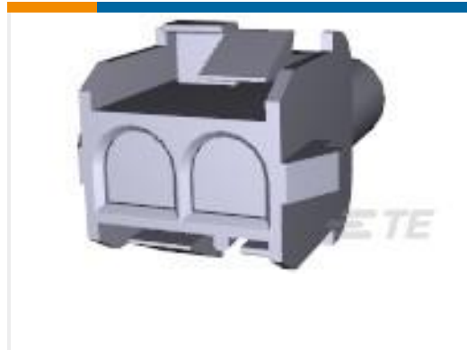
TE Part #1-480699-0 02P UMNL CAP HSG NATL