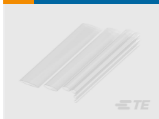
TE Part #NB19444001 RNF-100-3/16-CL-SP