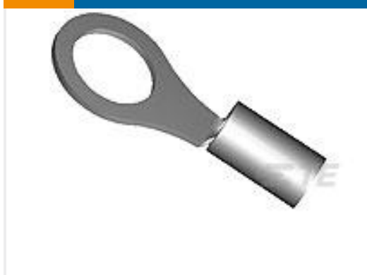
TE Part #322797 SOLIS R HR 22-16COM 22-18MIL 6