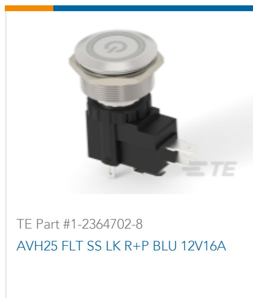
TE Part #1-2364702-8 AVH25 FLT SS LK R+P BLU 12V16A