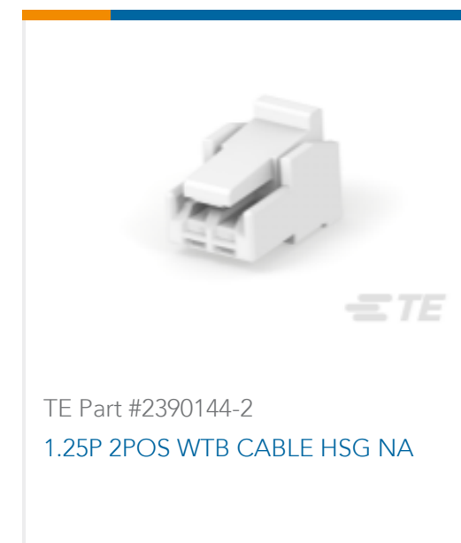
TE Part #2390144-2 1.25P 2POS WTB CABLE HSG NA