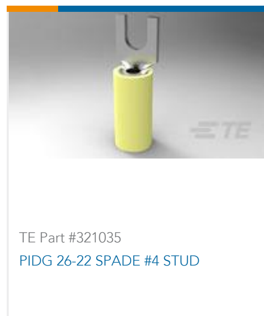
TE Part #321035 PIDG 26-22 SPADE #4 STUD