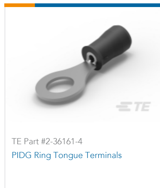
TE Part #2-36161-4 PIDG Ring Tongue Terminals