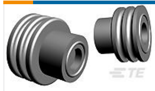
TE Part #1394511-1 EINZELLEITDICHTG,WS