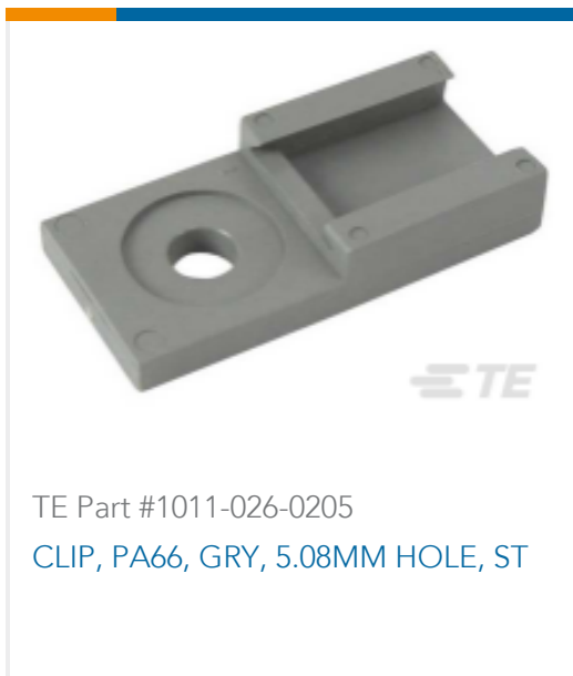
TE Part #1011-026-0205 CLIP, PA66, GRY, 5.08MM HOLE, ST