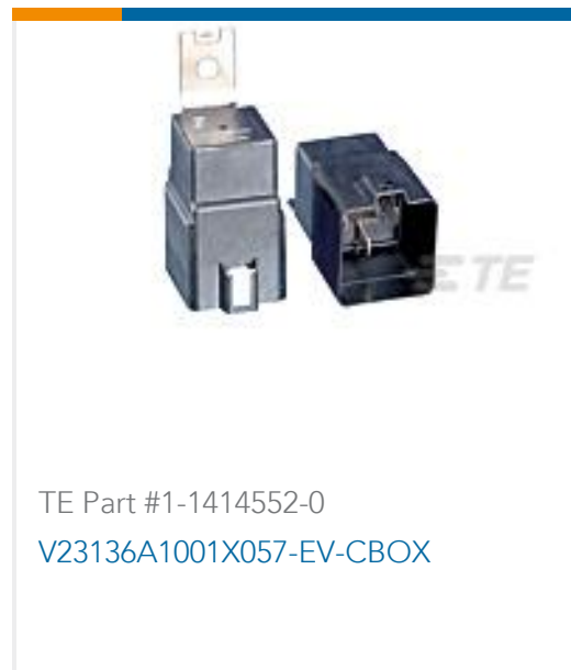
TE Part #1-1414552-0 V23136A1001X057-EV-CBOX