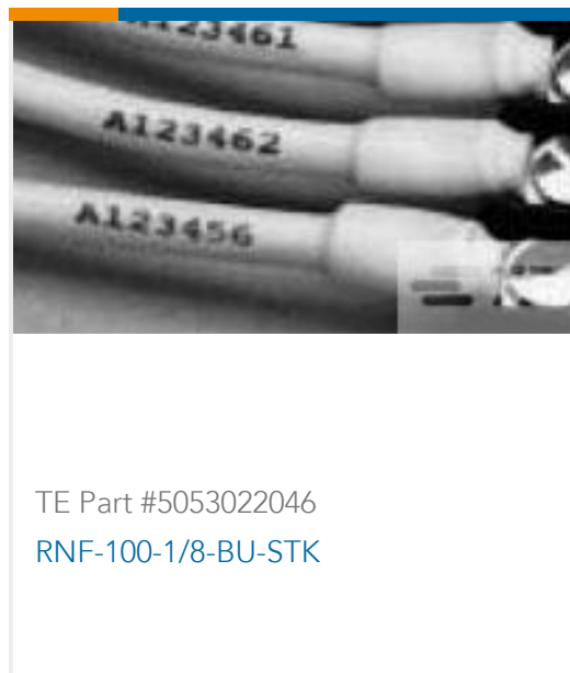
TE Part #5053022046 RNF-100-1/8-BU-STK