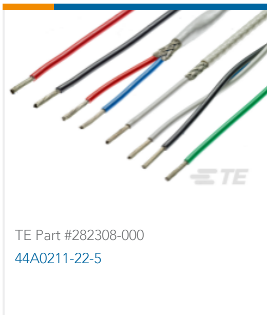
TE Part #282308-000 44A0211-22-5