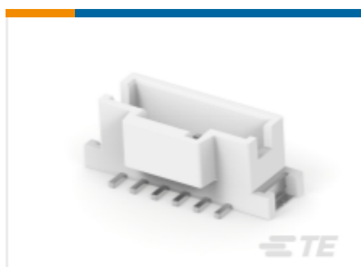
TE Part #1-2232829-6 SGI2.0 HEADER ASSEMBLY SMT 6P, KEY A,NTL