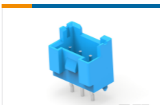
TE Part #2-2338245-3 EP2.5 HDR 3P VERT BOSS,BLUE,UL