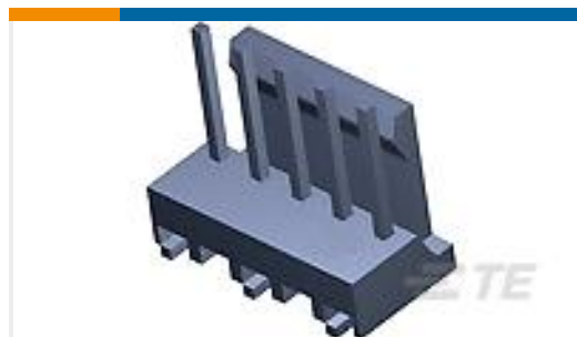
TE Part #3-647502-6 06P MTA100 SMT ASSY,SN,TAPE, LF