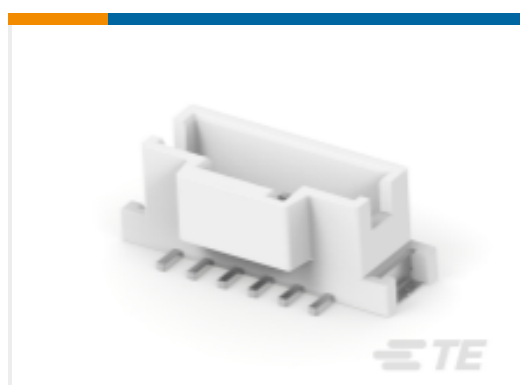
TE Part #1-2232829-6 SG12.0 HEADER ASSEMBLY SMT 6P, KEY A,NTL