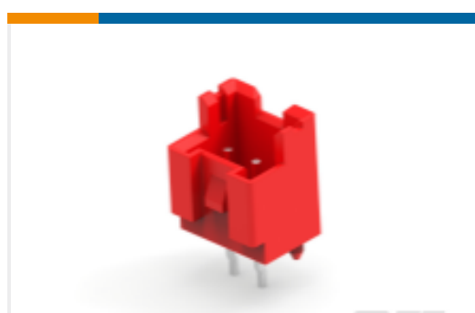
TE Part #2338245-2 EP2.5 HDR 2P VERT BOSS,RED,UL