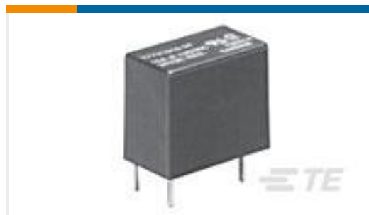
TE Part #1-1393194-9 T77V1D10-12