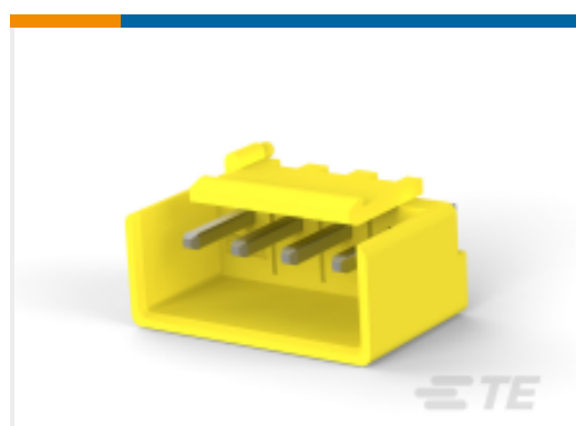
TE Part #1744484-4 04P EP SHRD HDR ASMY, YELLOW