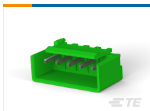
TE Part #1744485-5 05P EP SHRD HDR ASMY, GREEN