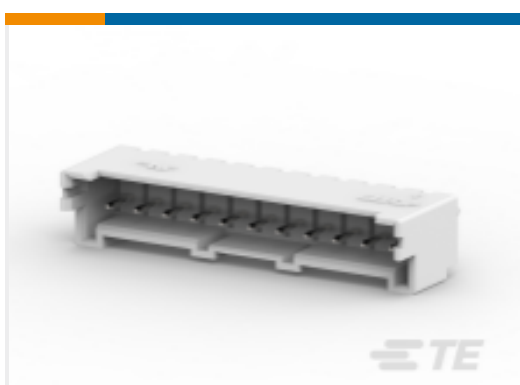
TE Part #1-1969730-1 EP2.5 SHROUDED HDR ASSY 11P VERTICAL