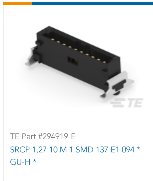
TE Part #294919-E SRCP 1,27 10 M 1 SMD 137 E1 094 * GU-H *