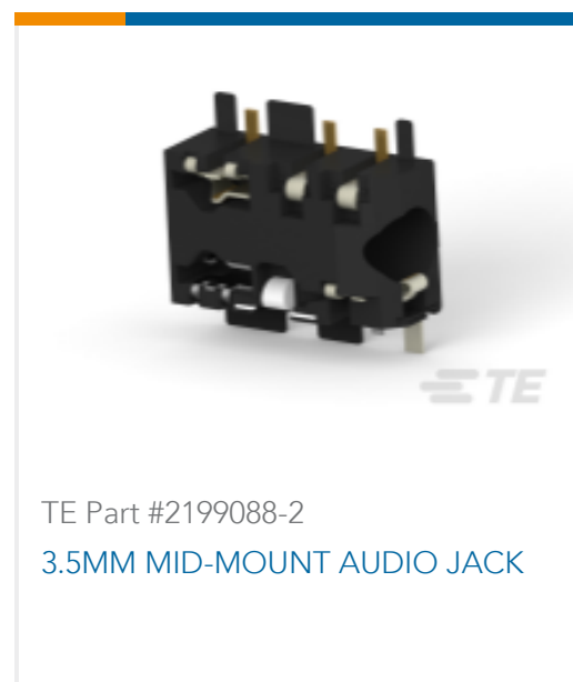
TE Part #2199088-2 3.5MM MID-MOUNT AUDIO JACK