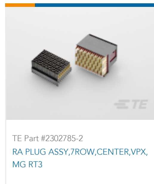
TE Part #2302785-2 RA PLUG ASSY, 7ROW, CENTER, VPX, MG RT3