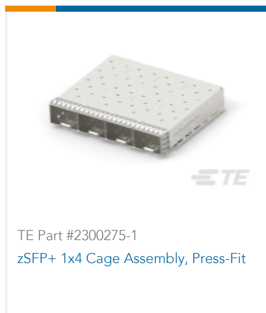
TE Part #2300275-1 zSFP+ 1x4 Cage Assembly, Press-Fit