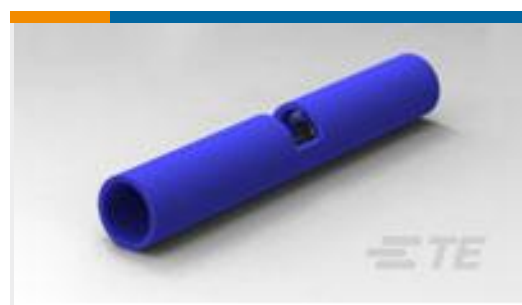
TE Part #327583 SPLICE BUTT PIDG 16-14/22-18