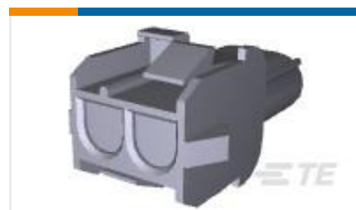
TE Part #350778-1 02P UMNL CAP HSG