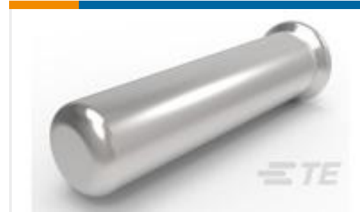
TE Part #147444-1 SOCKET,MIN-SPR AU-AU SER-1