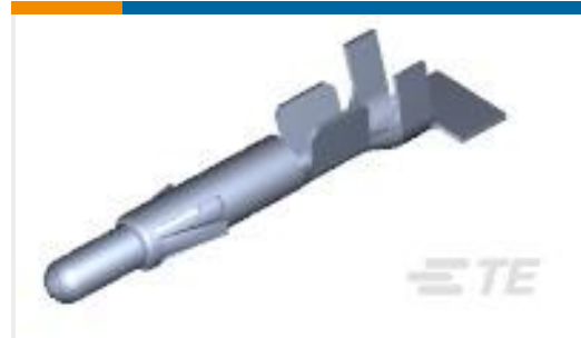
TE Part #350218-1 UMNL PIN 20-14 .0126PTPBR