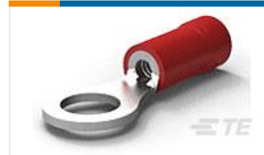
TE Part #34149 PG R 22-16 COMM 22-18 MIL 10