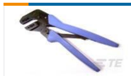
TE Part #58495-1 PRO CRIMPER ASSY MULTIMATE