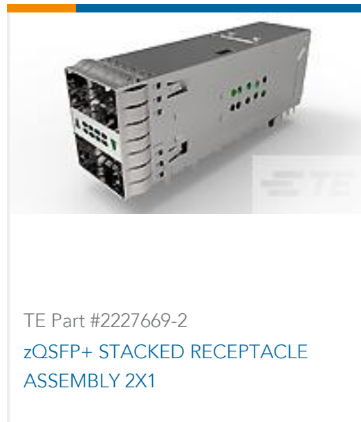
TE Part #2227669-2 zQSFP+ STACKED RECEPTACLE ASSEMBLY 2X1