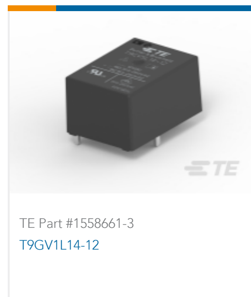
TE Part #1558661-3 T9GV1L14-12