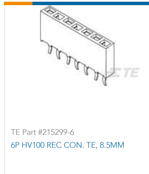
TE Part #215299-6 6P HV100 REC CON. TE, 8.5MM