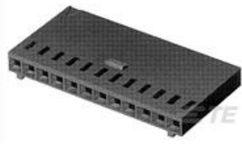
TE Part #1-102241-3 15 MODIV HSG COMP SR .100 POL