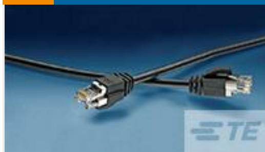
TE Part #2178127-2 Cable assy CLOUDSPLITTER - 5m