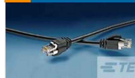
TE Part #2178127-1 Cable assy CLOUDSPLITTER - 2m