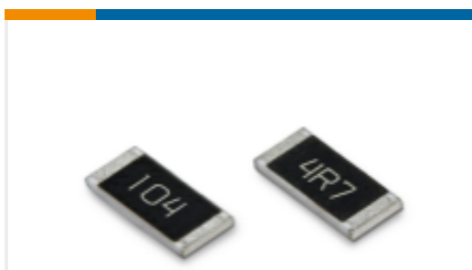
TE Part #7-2176280-4 CPF 0402 301K 0.1% 25ppm 5K RL