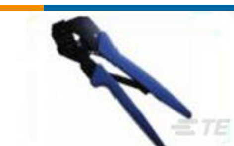
TE Part #2217299-1 SAHT HAND TOOL