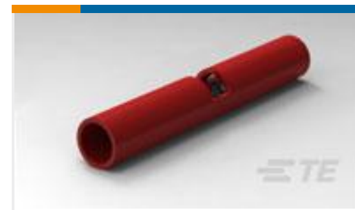
TE Part #320559 PIDG SPLICE 22-16COMM 22-18MIL