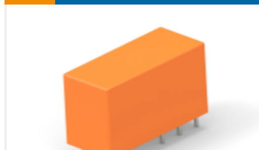
TE Part #2-1649328-9 RT334006