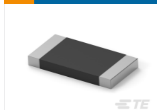
TE Part #4-2176421-1 TLRP 2512 2.0W R200 1% 25PPM 4K RL