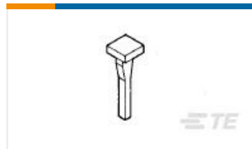
TE Part #86286-1 KEYING PLUG