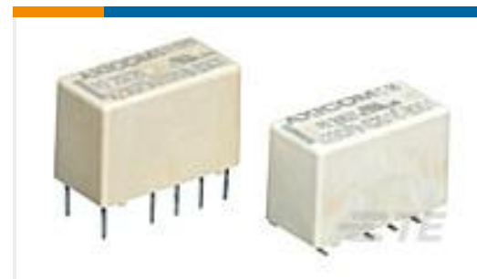
TE Part #1-1393788-6 V23079A1005B301