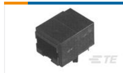
TE Part #5557785-1 MJ,8POS,R/A,LPF