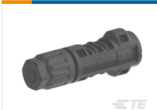
TE Part #2-2270024-1 SOLARLOK PV4-S DC Crimp Connectors